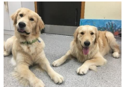
CAB puppies Porter (left) and Patriot, CAB funding pays for their on-going training at Kids and Canines.

To date, the students have trained over 84 dogs, with 64 of them being placed as mobility, autism or facility/therapy dogs, with a placement rate of 76%.