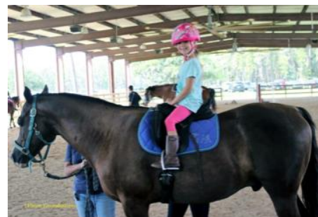
Pediatric oncology patient horseback at Quantum Leap Farm, a certified equine therapy program that collaborates with 1Voice.

In 2017, we were happy to award the foundation with a total of $15,000 towards the Pediatric Cancer Lab at the University of South Florida, to assist in preventing Leukemia. We are also pleased to support 1Voices's newest program, the Fit 4 Truth Weekend Retreats for Oncology teenagers. The retreat for patients and cancer survivors allows them to bond over their similar triumphs and struggles. The program includes team building, out-break sessions and five "Ways of Life" steps to stay strong and create your best life— mind, body and spirit.