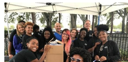
Students and mentors volunteering for Brew-Haha, a fundraiser for Starting Right Now in September 2017.

CLICK HERE to read about how SRN got its start.