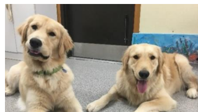
CAB puppies Porter (left) and Patriot, CAB funding pays for their on-going training at Kids and Canines.

We are thrilled to support a program that provides the opportunity to positively change the lives of our youth, but in turn provide well-trained services dogs to well-deserving individuals in the community.